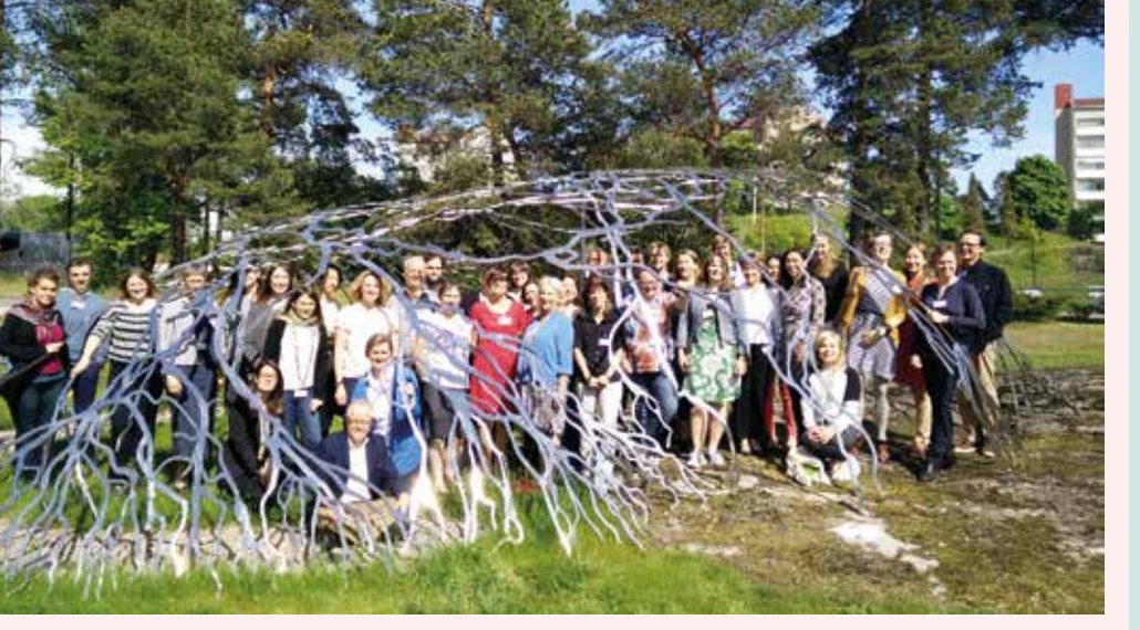
Members of the PACE (Comparing the effectiveness of palliative care for older people in long-term care facilities in Europe) consortium